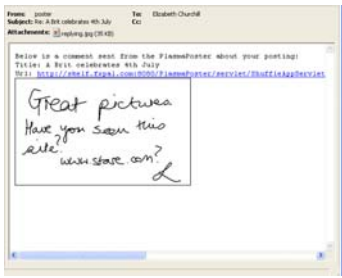
Figure 2: A comment on a community posting emailed to the author of that content. The email contains the comment and a URL to the original posting.

Given people’s propensity to interact through and around content in this way, we are developing methods that make content annotation a more prominent feature of the Plasma Poster Network and the Plasma Posters themselves. Inspired by instances of PDA used for sharing comments in focused collaboration, meeting and educational situations (e.g. [5,10]) we have extended the Plasma Poster Network to support capture of posted content to personal devices such as PDAs, creation of annotations for that content on the PDA (with text, graphics, and audio), and reposting of the annotated content to the system, and thus to the Plasma Posters. There are precedents for assuming people will post personal content on situated, public displays from personal devices. Examples include the Progress Bar’s Meshboard in London, UK where patrons can send images from cell phones [11], and the Appliance Studio’s TxTBoard, where SMS text messages can be sent to public displays [13]. To date, however, these technologies do not support inline annotation of existing content. Further, these technologies so far have focused on what has been called “person-to-place” publishing. We wish to extend this notion to “person-to-place-to-people-to-person” content annotation, augmentation and publication.