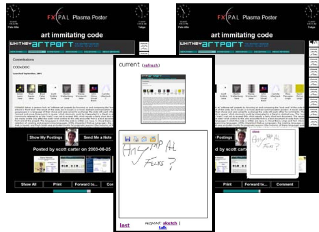
Figure 3: The Plasma Poster Interface, the posting represented on a PDA with the commenting facility visible, and the Plasma Poster display with the created annotation visible. The notes along the right edge of the Plasma Poster are all annotations that have been created by community members from their PCs, PDAs, or the “scribble” interface at the Plasma Poster itself.

Examples of current uses of public annotation can be found in several applications on the World Wide Web. The most common forms include newsgroups and Web-based discussion forums, bulletin-boards or “blogs”. Most are designed to be accessed, contributed to and read by lone individuals from PCs. Our design challenges have been to design easy-to-use and appealing methods for such annotation from mobile devices, and to produce interfaces that effectively display those annotations in public fora.