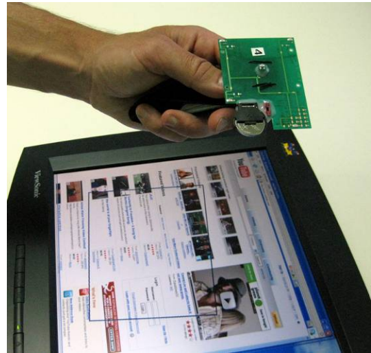
Figure 2. The recording application shown using the Sensing UI as the 6DOF input. The user holds a board outfitted with infrared LEDs (above) that is sensed by a mounted camera (not shown). The application provides feedback by tracing a rectangle that is deformed according to the positional and rotational information sensed by the input.

We initially ran a pilot study with two users on four tasks. Because our tools are experimental, we limited tasks in the pilot to