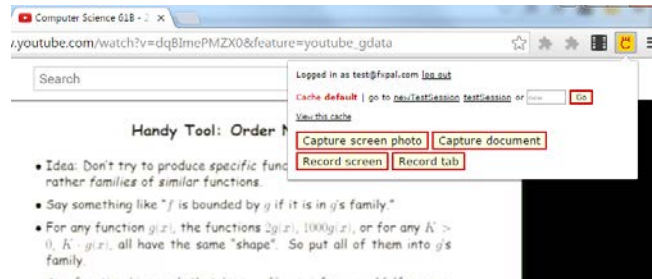
Figure 1. WorkCache includes an extension that allows users to capture multimedia screen content or documents. Screen content is uploaded to a back end server, indexed automatically, and added to a search-based user interface. Documents are sent to a separate service (see Figure 3).

http://dx.doi.org/10.1145/2964284.2973809