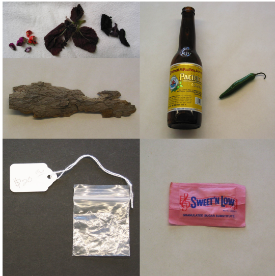
Figure 1. A selection of tangible objects collected by participants in the festival study. “The flowers (upper left) ... mirror how I think about jazz.”

with structured, question-and-answer based annotations. Our studies also revealed the usefulness of different media in different situations. Specifically, we found that images lead to more specific recall than any other medium, but that audio, in addition to making it easier for participants to capture information that does not have a visual representation, can be used clandestinely in situations in which participants do not feel comfortable using a photo to capture an event. We found that information about location does not significantly impact recall, and that tangible objects are more likely than other media to prompt discussion of broad attitudes and beliefs (Figure 1). We also noticed unforeseen issues in elicitation interviews. For example, while media capture lent itself to a sequential review of data, interview discussion tended to follow themes, causing problems for participants and researchers when they referenced captured data out-of-sequence.