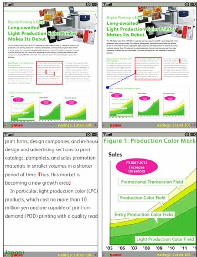
Figure 1: SeeReader automatically indicates areas of visual interest while reading document text aloud. The visual display shows the current reading position (left) before it encounters a link (right). When viewing the whole page, SeeReader indicates the link (top). When viewing the text, SeeReader automatically pans to the linked region (bottom). In both views, as the link is encountered, the application signals the user by vibrating the device.

SeeReader is the first mobile document reader to support rich documents by combining the affordances of visual document reading with auditory speech playback and eyes-free navigation. Traditional eReaders have been either purely visual or purely auditory, with the auditory readers reading back unstructured text. SeeReader supports eyes-free structured document browsing and reading as well as automatic panning to and notification of crucial visual components. For example, while reading the text "as shown in Figure 2" aloud to the user the visual display automatically frames Figure 2 in the document. While this is most useful for document figures, any textual reference can be used to change the visual display, including footnotes, references to other sections, etc.