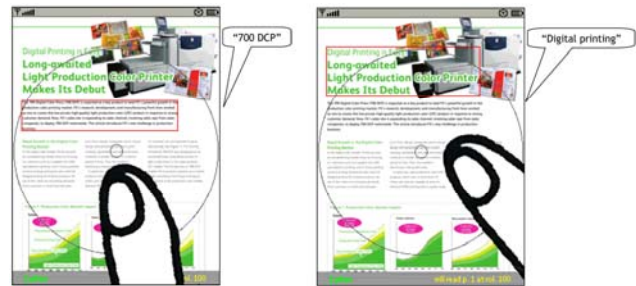
Figure 3: A user interacting with the touchwheel. As the user drags her finger around the center of the screen, the application vibrates the device to signal sentence boundaries and plays an audio clip of the keyphrase summarizing each region as it is entered.

The interface supports primarily three different views: document, page, and text. The document view presents thumbnail representations of all available documents. Users can select the document they wish to read via either the number pad or by directly pressing on the screen.